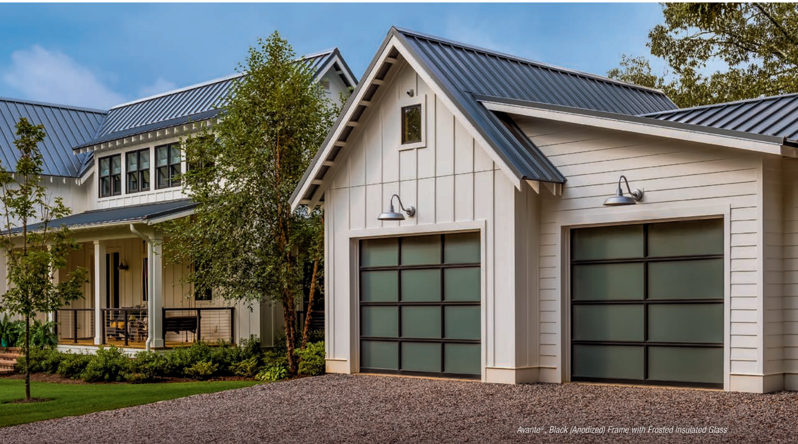
Avante® - Black (Anodized) Frame with Frosted Insulated Glass