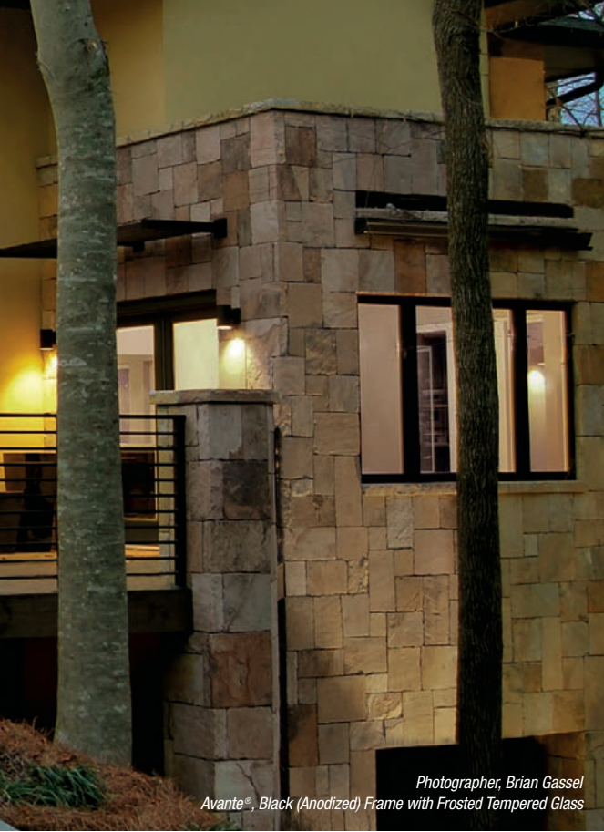
Avante®, Black (Anodized) Frame with Frosted Tempered Glass