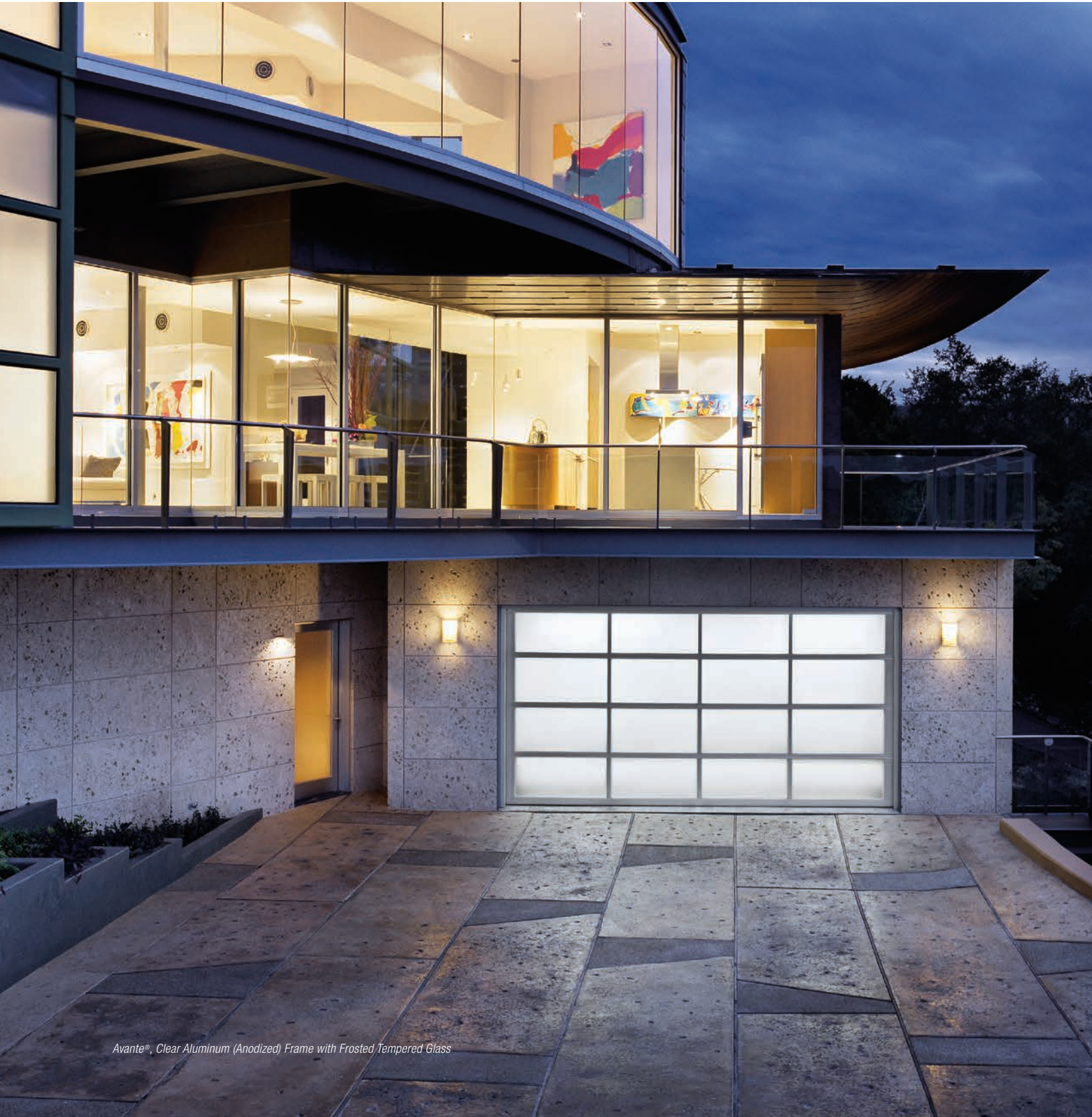
Avante®, Clear Aluminum (Anodized) Frame with Frosted Tempered Glass