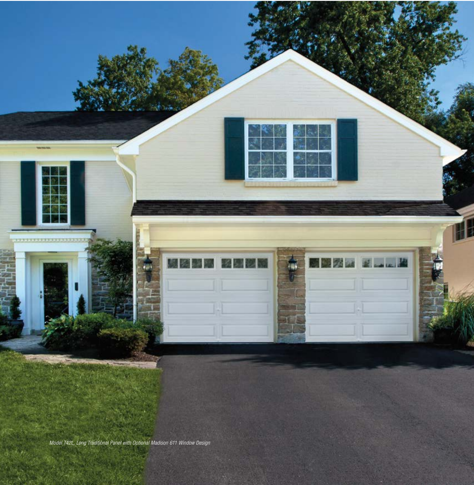
Model T42L, Long Traditional Panel with Optional Madison 611 Window Design