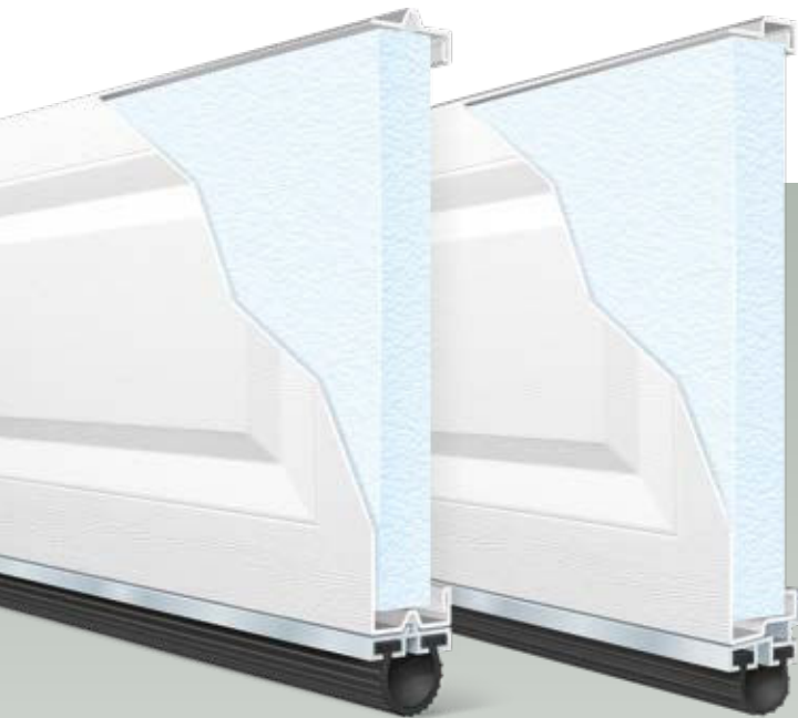
Tongue-and-Groove Section Joints

Improve your home's appearance and energy efficiency with a Clopay Value Plus insulated garage door. Available in 24 or 25 gauge steel with 1-5/16" polystyrene insulation, Value Plus models offer moderate insulating R-values, strength and security, as well as quiet operation and a beautiful appearance. Choose from two panel styles, many color options and a wide range of window options to create a door that fits your budget and enhances your home's curb appeal.